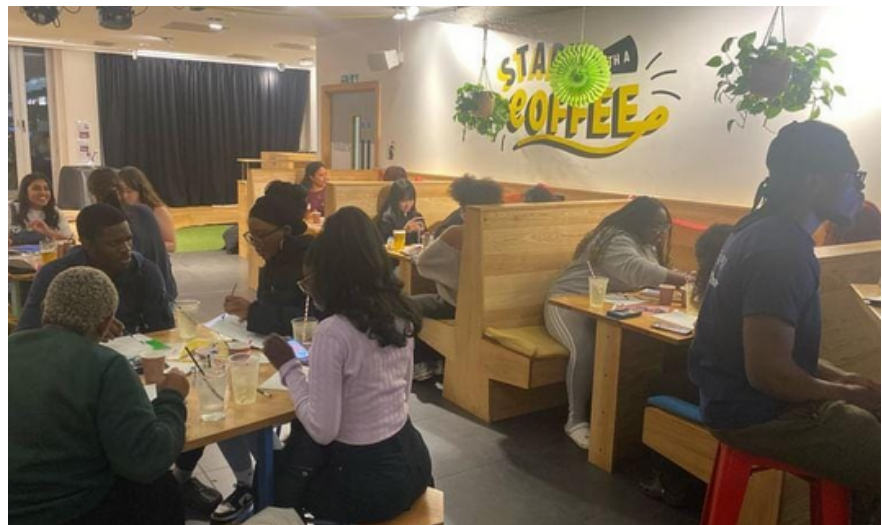
PAINT & SIP EVENT | RICHMOND BUILDING, UNIVERSITY OF BRISTOL, PHOTOGRAPH: BSN PRESS - 25/10/23