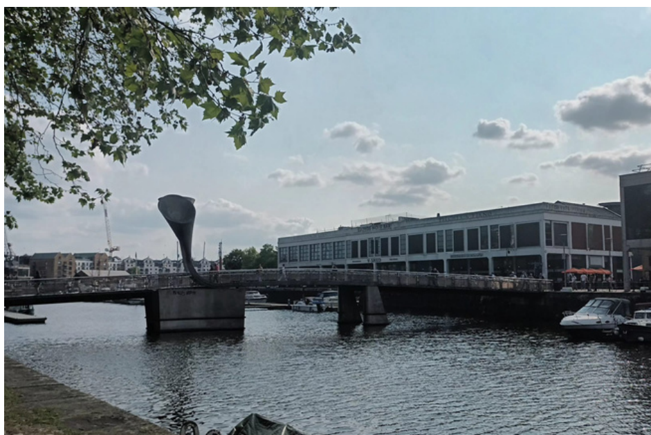
Pero's Bridge| Clifton| Bristol| Photograph: mmsyuphotos |22/05/23