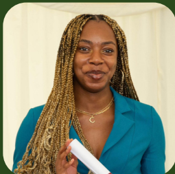
CYRINA COMMUNITY OUTREACH OFFICER