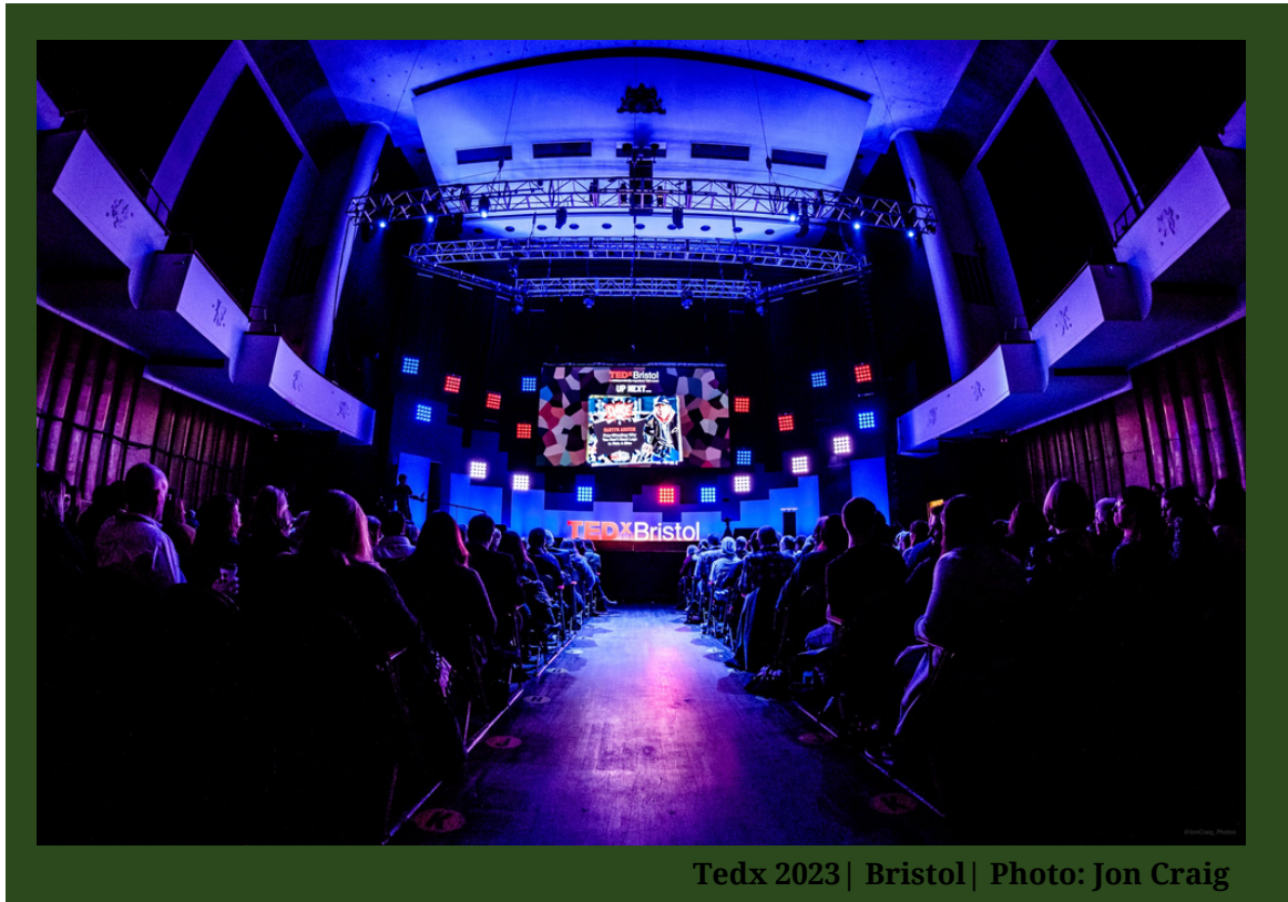
Tedx 2023 | Bristol

TEDx University of Bristol x = independently organized TED event