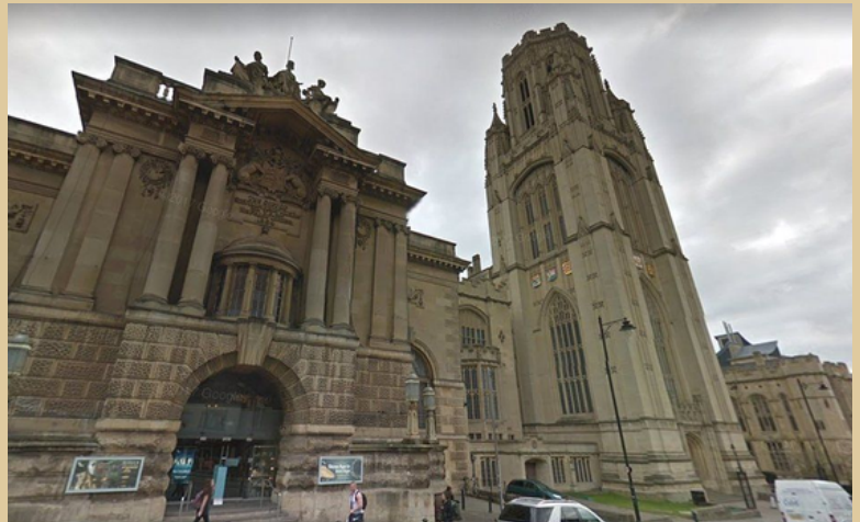
WILLS MEMORIAL BUILDING, UNIVERSITY OF BRISTOL, - 04/07/17

The outcome of the consultation on changing building names associated with Bristol’s role in the transatlantic slave trade, and as part of the decolonisation initiative has just been released. The university have decided to disassociate themselves with the Colston family, removing their dolphin insignia from the logo. This comes just six months after renaming a university residence that was labelled after the family name. The university are sighting indirect ties, on this basis, but have remained in alignment with both the Will and Fry family, who have ties in funding to the institution. Both of which also had hands in the slave trade. There has been a further promise established of a 10 year reparative futures investment programme, costing £10million.