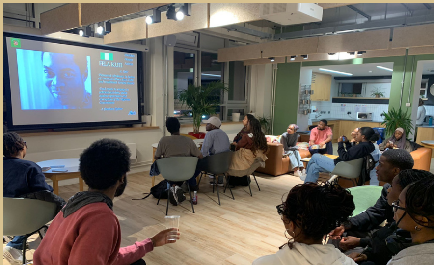
BSN Refreshers | Senate House | Bristol | Photograph: BSN PRESS | 23/1/24

SEO /LONDON SPONSORS FOR EDUCATIONAL OPPORTUNITY