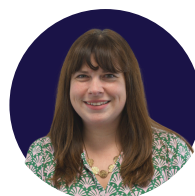
The Bristol SU Director Team