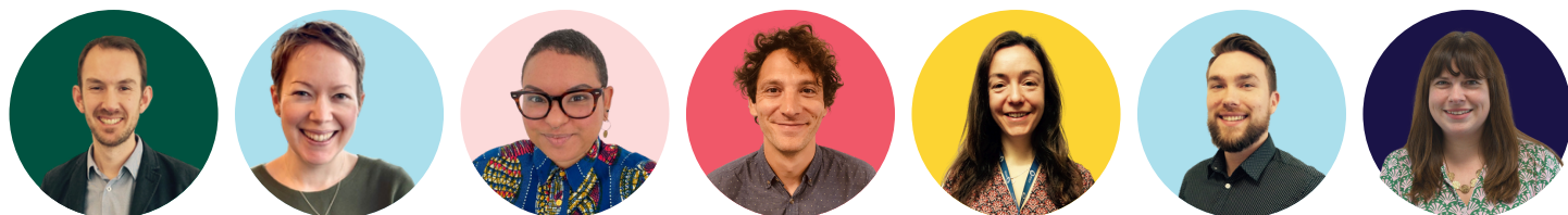
The Bristol SU Director Team

Most importantly, you'll be committed to making a difference to the lives of our 32,000 members (students) and around 400 clubs and societies.