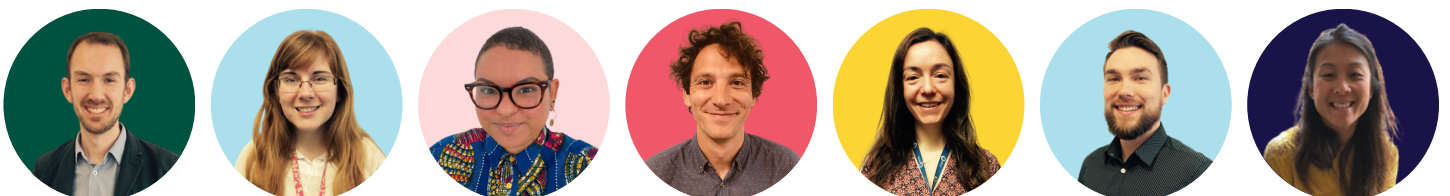
The Bristol SU Director Team

If you're excited to help shape the future of a charity that improves the lives of 30,000 members and want to build your career in an award-winning organisation with a supportive, rewarding and inclusive working environment, we'd love to hear from you.