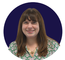
The Bristol SU Director Team