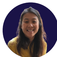
The Bristol SU Director Team