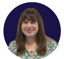
The Bristol SU Director Team